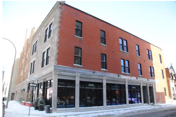
West Façade Facing Gladstone Avenue