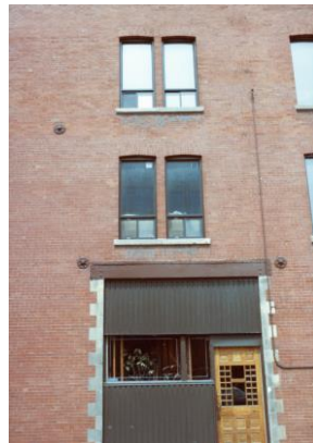
Portion of the façade Facing Gladstone Avenue 1983