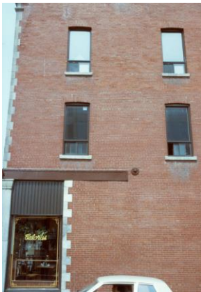
Portion of the Façade Facing Gladstone Avenue 1983