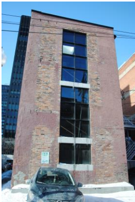
South Façade (partial)