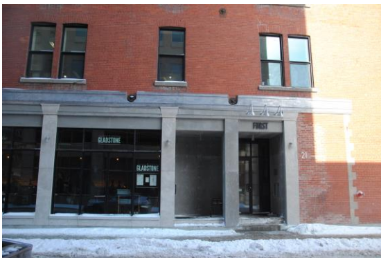
West Façade Showing Traces of Alterations