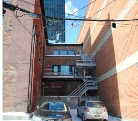
South Façade (partial)