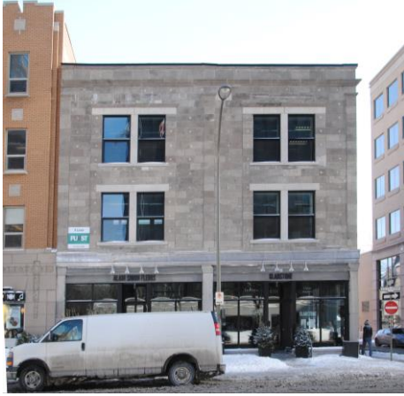
North (Front) Façade