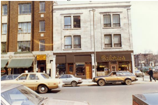
Front façade Facing Sainte-Catherine Street 1985